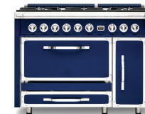
Tuscany range in dark blue, $16,799; vikingrange.com.

FINE METALLICS ELEVATE LUXURY APPLIANCES TO BESPOKE CENTERPIECES.