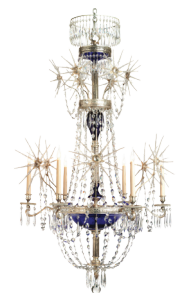
HANDBLOWN CONFECTION Bristol Starburst chandelier, $30,683; coxlondon.com.