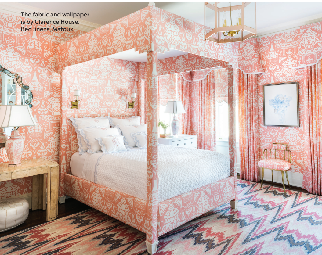
The fabric and wallpaper is by Clarence House. Bed linens, Matouk

The large-scale pattern lends itself well to a vibrant guest room. Solis , to the trade; thibautdesign.com.