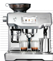
FOR BOUTIQUE BREWS Oracle Touch espresso machine, $2,500; breville.com.