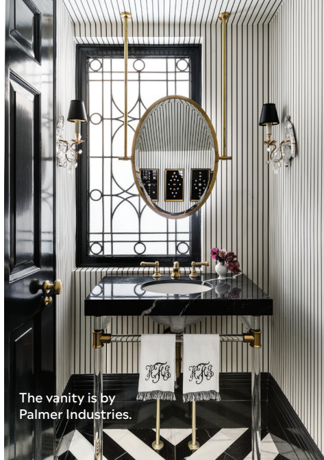
The vanity is by Palmer Industries.