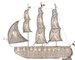
FAIRY-TALE REDUX Crystal Ship chandelier, to the trade; paulferrante.com.