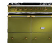
Cluny range in olive, $8,700; frenchranges.com.