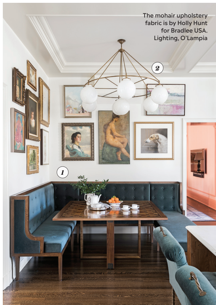
The mohair upholstery fabric is by Holly Hunt for Bradlee USA. Lighting, O’Lampia

7 LACANCHE RANGE: The kitchen’s crown jewel, a French range trimmed in brass and nickel inspired the custom hood. “We massaged and massaged the design to get the proportions right. The rivets alone are stunning, with so much beautiful detail.”