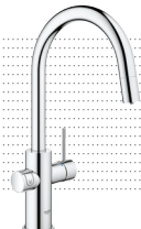
FOR SPARKLING TAP WATER Blue chilled and sparkling faucet, from $2,799; grohe.us.