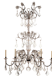
REFINED ROCK CRYSTAL Queeze chandelier, to the trade; dennisandleen.com.

THE CRYSTAL CHANDELIER REMAINS THE GRANDE DAME OF DINING ROOMS.