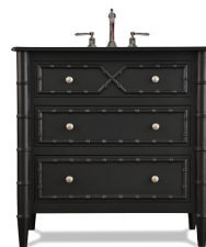
Bristol sink base with drawers in onyx, $3,395; jtribble.com.