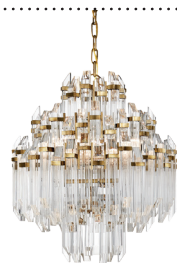
TIERED WATERFALL Adele chandelier by Suzanne Kasler, $3,800; circalighting.com.