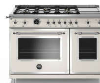
Heritage Series range in ivory enamel, $11,999; us.bertazzoni.com.