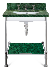
Single Taw vanity basin in green verde Guatemala, $6,275; drummonds-uk.com.