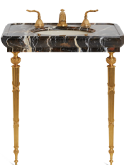
Hexagon counter and Ribbon & Reed legs, price upon request; sherlewagner.com.