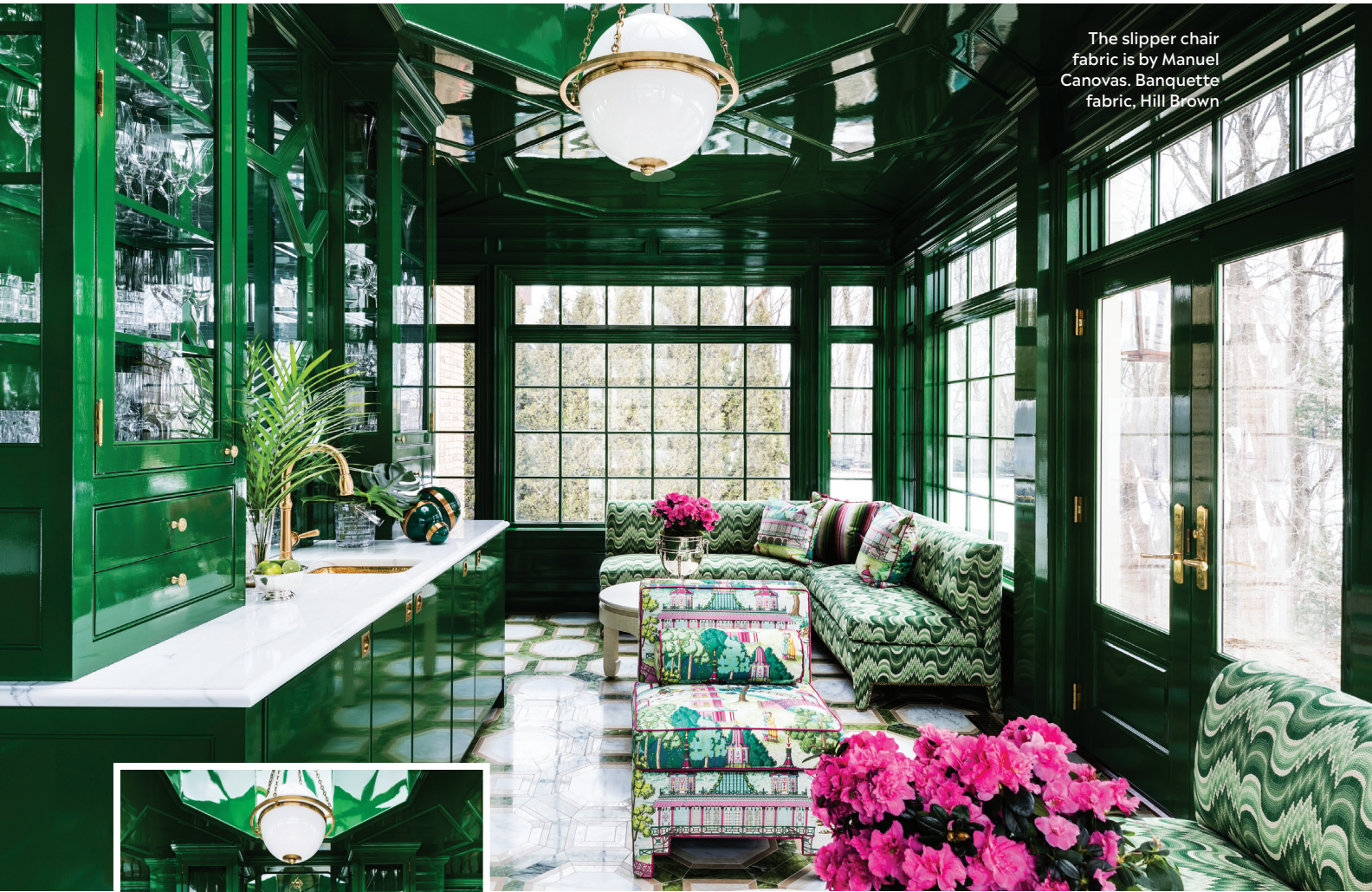
The slipper chair fabric is by Manuel Canovas. Banquette fabric, Hill Brown