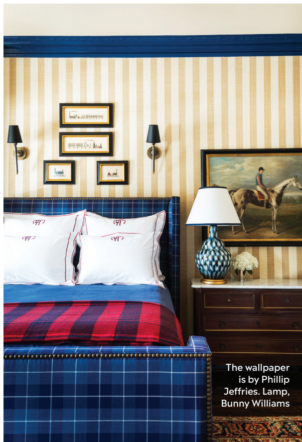
The wallpaper is by Phillip Jeffries. Lamp, Bunny Williams

CAVIN-WINFREY layers on the pattern for cozier bedrooms, giving them “a sense of order that’s timeless but pleasing.” Mixing trusty classics—for instance, a handsome blue plaid with vertical stripes in cream and gold—gives fresh perspective to familiar patterns. In a more feminine bedroom, a bold bargello rug lends gutsy contrast to a traditional pink pagoda print on walls, windows, and bed upholstery. Bedcoverings in both are luxurious but tidy. “I like to keep the linens easy and manageable,” she says. ♦