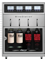
FOR TASTING FLIGHTS Heritage WineStation, price upon request; dacor.com.

TURNING ESPRESSO MARTINIS INTO A HOUSE SPECIALTY, THE LATEST BEVERAGE INNOVATIONS PERK UP EVERYDAY OFFERINGS.